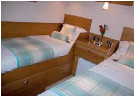
right: Luxurious en-suite cabin and dining area