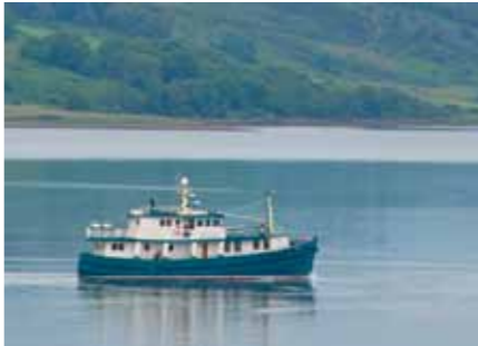
right: Scotia W cruising in the Moray Firth Eilean Donan Castle, Skye and Lochalsh district

Aboard Scotia Charters' luxury private charter vessel Scotia W you will sail through some of Scotland's most dramatic scenery and visit places only our cruises can reach.